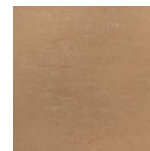
24 x 24 (23 5 / 8 x 23 5 / 8 ) FM20960041