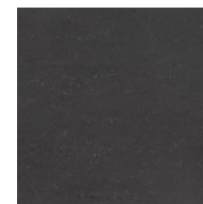
24 x 24 (23 5 / 8 x 23 5 / 8 ) FM20960311