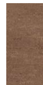
12 x 24 (11 3 / 4 x 23 5 / 8 ) FM20957251