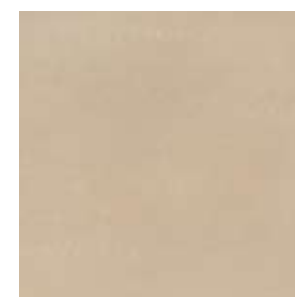
24 x 24 (23 5 / 8 x 23 5 / 8 ) FM20960011