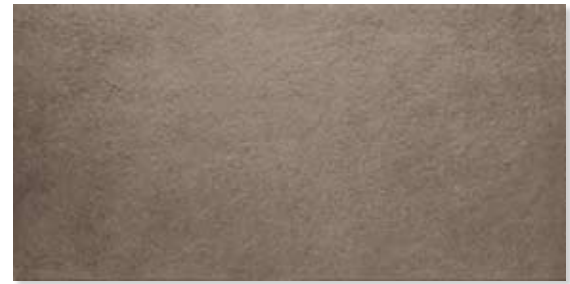
24 x 48 (23 5/8 x 47 1/4) F3RT454231