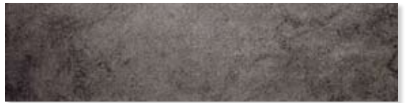
12 x 48 (11 3/4 x 47 1/4) F3RT45N311 F3RT55N311† (Striated)