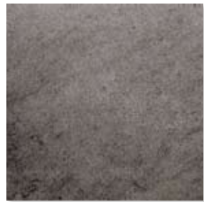
24 x 24 (23 5/8 x 23 5/8) F3RT460311 F3RT560311† (Striated)