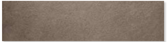
12 x 48 (11 3/4 x 47 1/4) F3RT45N231 F3RT55N231† (Striated)