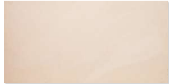
24 x 48 (23 5/8 x 47 1/4) F3RT454371