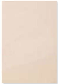
16 x 24 (15 3/4 x 23 5/8) F3RT47V371 F3RT57V371† (Striated)