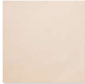
24 x 24 (23 5/8 x 23 5/8) F3RT460371 F3RT560371† (Striated)