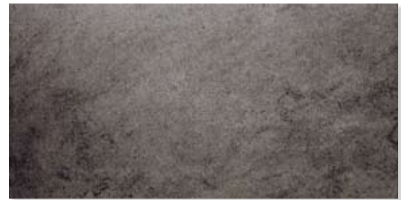
24 x 48 (23 5/8 x 47 1/4) F3RT454311