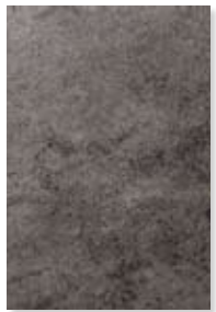
16 x 24 (15 3/4 x 23 5/8) F3RT47V311 F3RT57V311† (Striated)