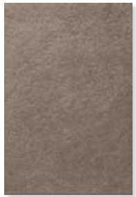
16 x 24 (15 3/4 x 23 5/8) F3RT47V231 F3RT57V231† (Striated)