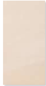
12 x 24 (11 3/4 x 23 5/8) F3RT457371