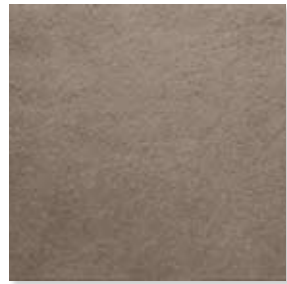
24 x 24 (23 5/8 x 23 5/8) F3RT460231 F3RT560231† (Striated)