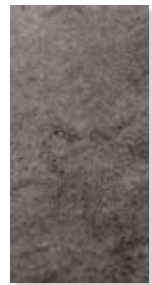
12 x 24 (11 3/4 x 23 5/8) F3RT457311