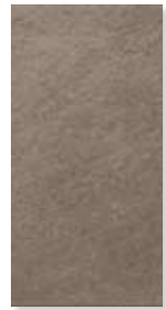
12 x 24 (11 3/4 x 23 5/8) F3RT457231