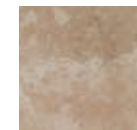
6 1/2 x 6 1/2 (6 1/2 x 6 1/2) RFSE320-6