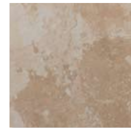
13 x 13 (13 x 13) RFSE320-13