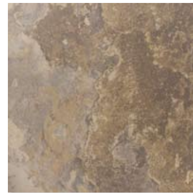
20 x 20 (19 3/4 x 19 3/4 ) RFSE321-20