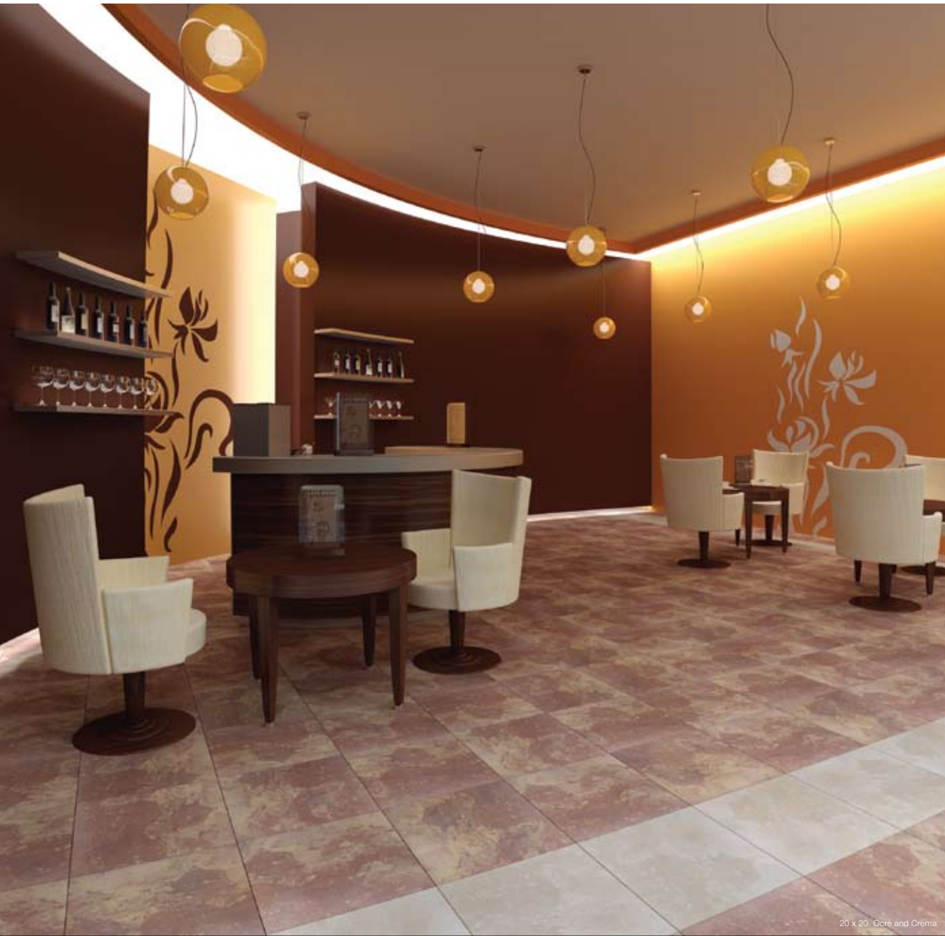
20 x 20 Ocre and Crema