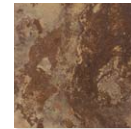
13 x 13 (13 x 13) RFSE322-13