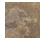
6 1/2 x 6 1/2 (6 1/2 x 6 1/2) RFSE321-6