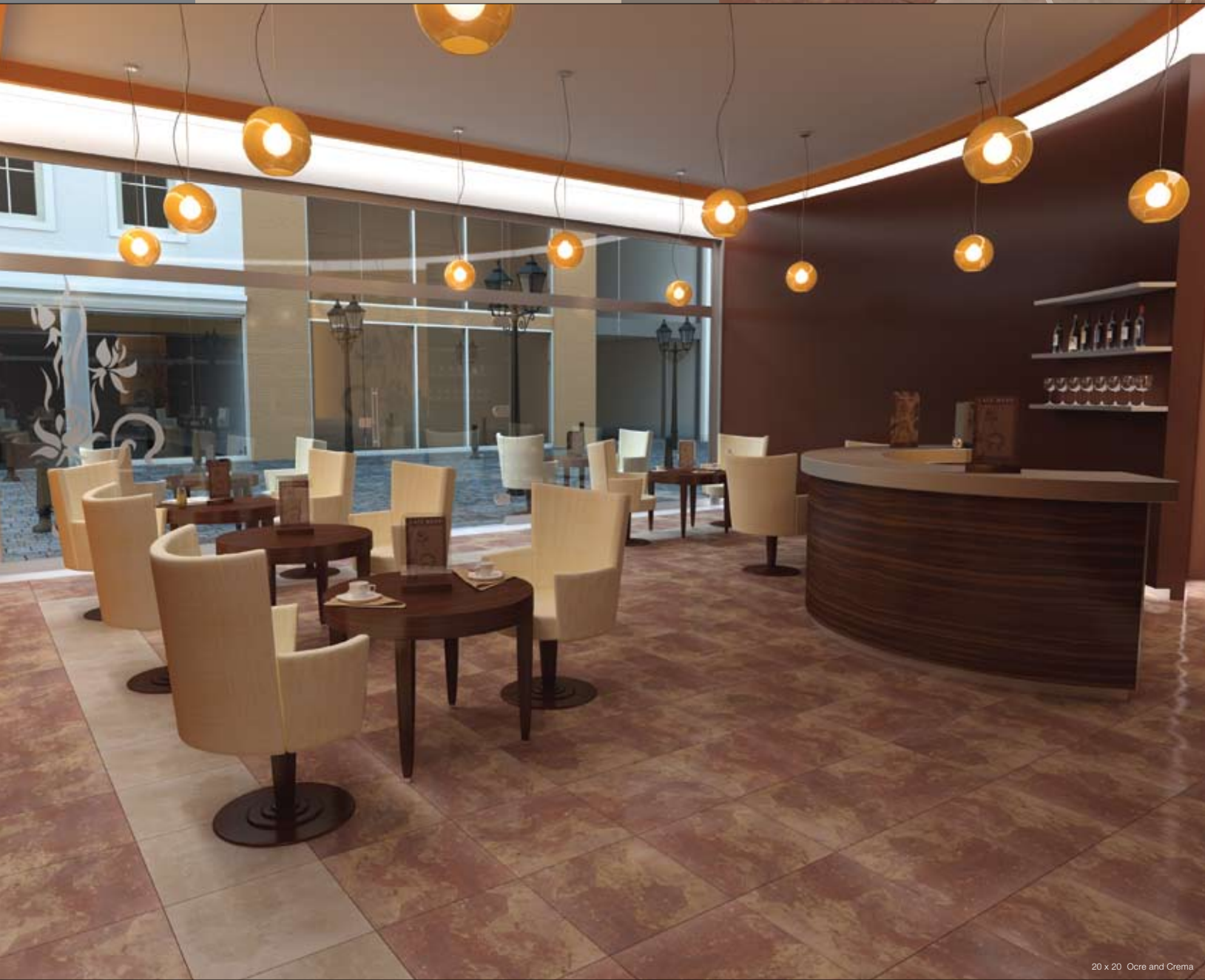
20 x 20 Ocre and Crema