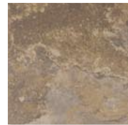
13 x 13 (13 x 13) RFSE321-13