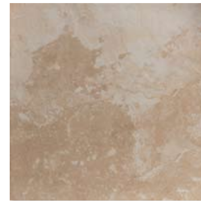
20 x 20 (19 3/4 x 19 3/4 ) RFSE320-20